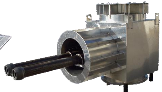
BOX Style Flame Arrested Burner