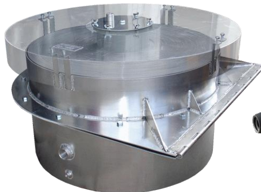
2 Piece Style Flame Arrested Burner