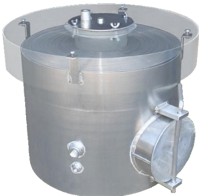
'O' Style Flame Arrested Burner

Wenco Box Style Flame Arrested Burners (FAB's) are used in higher BTU ratings, generally 2.5 MM BTU to 10.0 MM BTU applications. Construction for both styles is from Aluminum Sheet with Aluminum Elements. Fire Box Flame Arrested Burners provide the heat source for Oil & Gas Production Equipment such as Heater-Treaters, Line and Tank Heaters and Glycol Dehydration Units. The BTU rating of the vessel typically determines the size of the Fire Box Flame Arrested Burner.